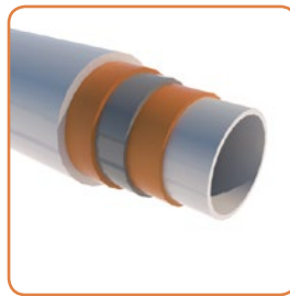
Underfloor Heating Pipe Highly Flexible 5-layer PE-RT Pipe