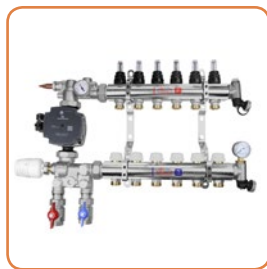
Manifold 2-12 Way High Temperature Self Regulating Manifold